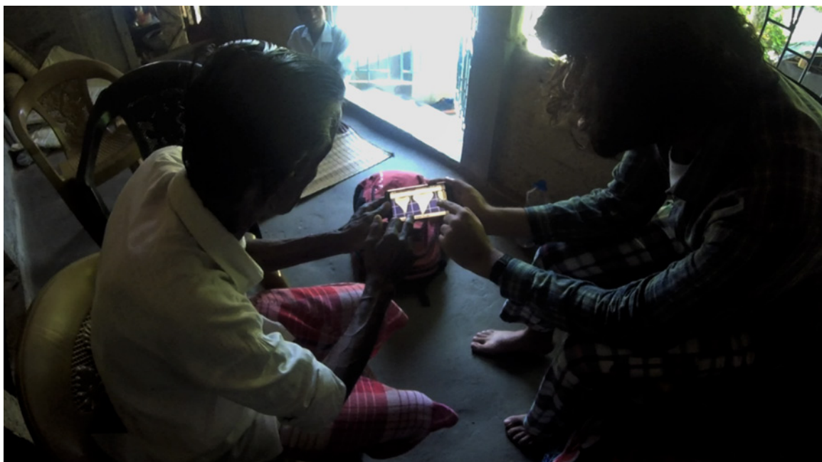
Image 2. Priyankar showing a fisher the shark teeth shape to confirm if Kamots are sharks.

The local experts in all the interviews agreed to the fundamental premise that Kamots are indeed sharks. The locals had experience with them from time immemorial, but anthropogenic effects have decreased their numbers in the region. Hence, based on decades of knowledge of locals cohabiting with the animals and identifying them accurately, our hypothesis seemed to hold that Kamots are indeed sharks.