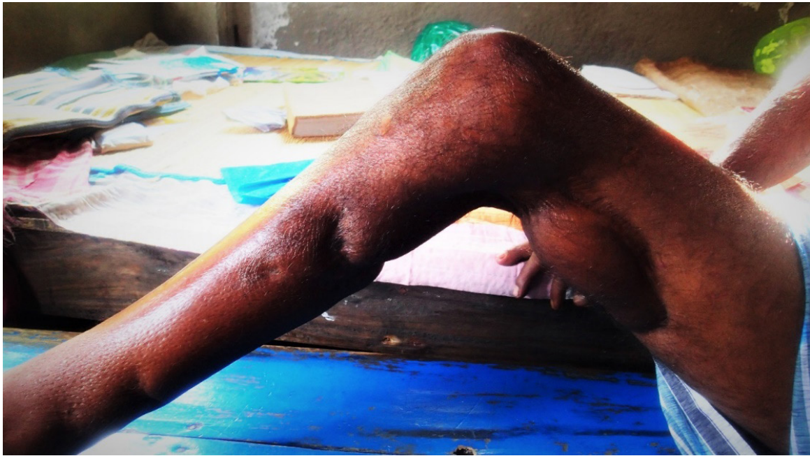
Image 4. A shark bite on a man from 1997 when he was in the water, fishing (Raj Sekhar Aich).