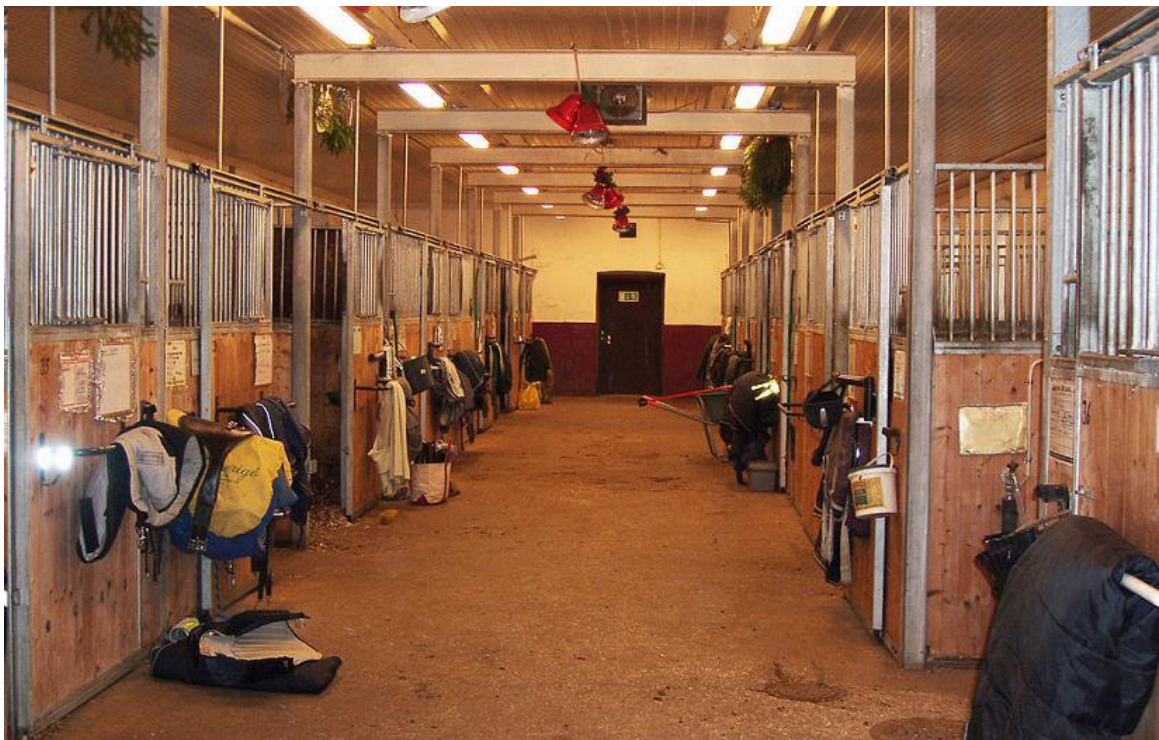
Figure 1: Stabling in a barn in Sweden

Stabling horses means enclosing them within barriers for periods of time. Humans may, or may not, move in and out of this physical space at different times. How we keep horses, and make priorities around equine husbandry, depend upon many factors – economics, the purpose for which the horse is kept, as well as what might be termed equestrian cultures (Latimer & Birke 2009). What is prioritised in choosing to house horses in stables is human access and ability to control the animal's immediate environment; interspecies social engagements are thus shaped by where they occur.