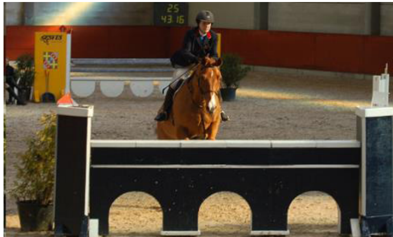
Figure 4: approaching a jump; both horse ('Tiger') and rider focus on the fence ahead

Such competitions entail humans and horses negotiating their conjoint movements in specific ways, as moving over or through obstacles. They require specific skills, not only in terms of riding techniques, but also of spatial judgements: how many strides do we fit into that space between jumps? How do we achieve that? How do we make that turn? How fast can we risk going with that slope? We cannot know how horses directly experience these endeavours, although horse people commonly speak of particular horses as 'loving the buzz' of competitions. The animals do, however, learn over time how to participate, and contribute their judgement to the shared activity, to develop the apparent mutuality so important to horse-riders.