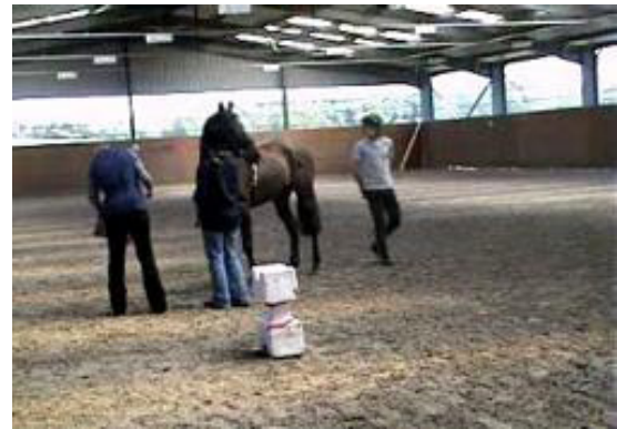
Figure 3: Kez and her human, L., assessing from moment to moment where the other is