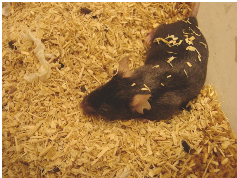
Figure 5: A mouse with ear cuts

Of all the XPA-mice born in the breeding facility, only the ones with genotype -/- were used in experiments. To find the mice with the desired genotype, they were genotyped. This was done by cutting of a piece of the tail, which was sent to the lab for