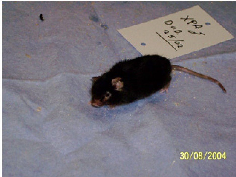
Figure 1: An XPA-mouse

This article is about mice. More specifically about several generations of transgenic mice, XPA-mice, that were born, lived and died in the laboratory of the National Institute of Public Health and Environment (RIVM) in Bilthoven, the Netherlands during the 1990s and 2000s. They were exposed to carcinogens to test if they were more sensitive to these substances than 'regular' mice. 1 The XPA-mouse in the picture is six months and five days old. If you look closely at her left ear, you can see that a few pieces of ear have been cut away. This was done so she could be told apart from other mice living in the same cage.