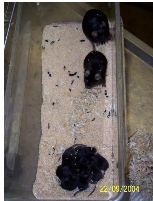
Figure 4: A mouse family in a cage

The ‘breeding system’ also focused on efficiency. A male and female mouse lived together 24/7 in the same cage; a system called permanent meeting breeding. When a female mouse gave birth, the baby mice stayed in the same cage for about 18 to 20 days. The picture above shows such a mouse family together in a type-1-elongated cage. The permanent meeting system had the ‘advantage’ of making use of the female mouse’s postpartum estrus. After giving birth, she is fertile for 12-24 hours. If the male mouse is in the same cage the whole time, the female mouse can become pregnant again,