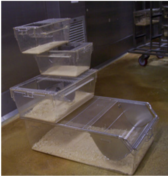
Figure 3: four types of cages

In a breeding efficiency study, it was found that mice PEI is higher in cage type 2, where the mice have more space than in type 1-elongated. But because type 1-elongated is narrower than type 2, it is possible to fit more type 1-elongated than type 2 cages into the same animal room. Therefore, XPA mice were living in type 1-elongated cages during the breeding process. The regular type-1 cage could not be used as animal welfare regulation had deemed it too small. Regulations also stipulated that the cages be ‘enriched’ with bedding and nesting material. According to A1, not all lines of