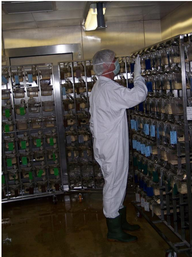
Figure 2: Animal Breeding Room

Humans held the XPA-mice in cages to prevent them from leaving. This may seem too obvious to even mention, but let us pause for a second and consider what a cage does. A cage first of all controls the space you can and cannot be in, who you can and cannot have contact with inside the cage. Beings you share the cage with or who have access to it cannot be avoided. The location and physical characteristics of the cage determine what you can observe and who you can contact outside of the cage and vice versa. A cage is also a constant reminder of the liveliness of these mice, dead mice or non-living materials do not need to be confined. The picture below shows a typical layout of one of the several animal rooms at the XPA-mouse breeding facility.