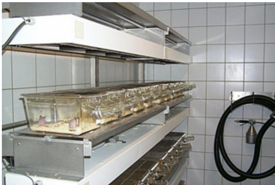
Figure 6: Mice being exposed to UVB

During the carcinogenicity experiments, mouse-human intra-action consisted mostly of handling the mice to clean the cages and exposing mice to test substances. XPA mice were exposed to either carcinogens or non-carcinogens during either six or nine months. 9 Exposure happened in several ways: UV-light exposure (figure 6), rubbing a substance on the skin, force feeding (gavage) or mixing a substance in the food.