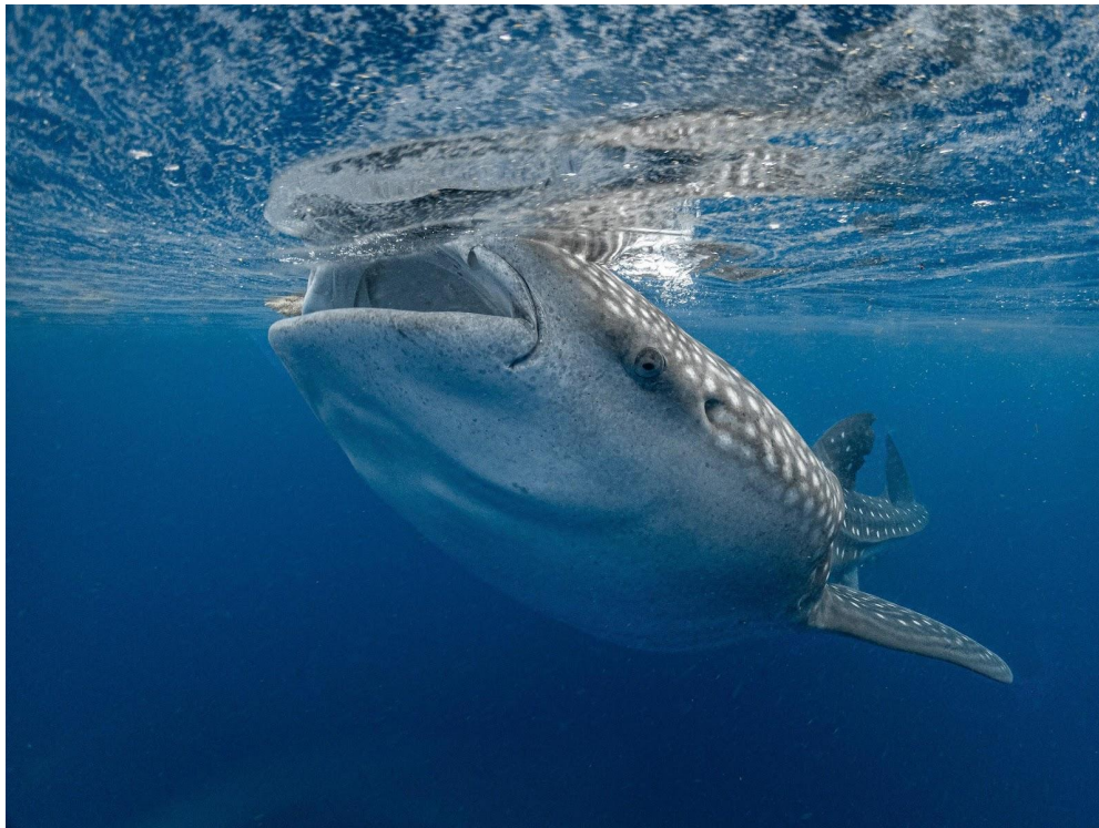
Figure 5: Whale Shark. 6. 6. 2020, Isla Mujeres, Mexico