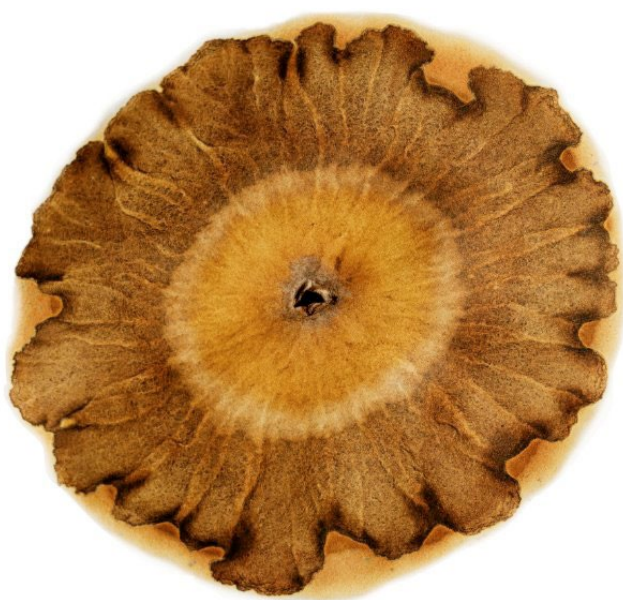
Fig. 4: Soil+Oak portrait, National Forest, Swadlincote, July 2023