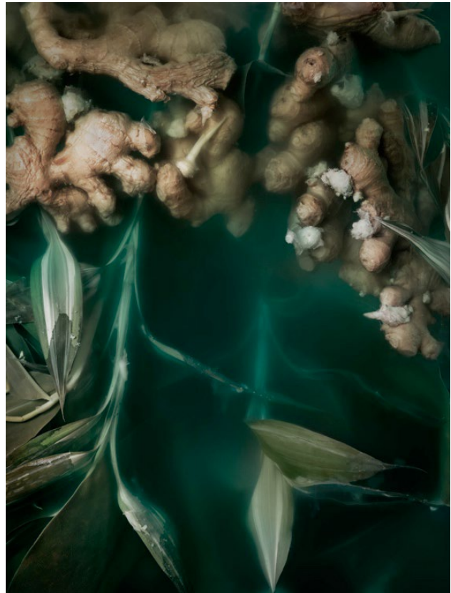
Fig. 1: She could lie on her back and sink (ginger, imbir, Asian ginger, zingiber), 2022. Archival giclée print on Hahnemühle bamboo, 840 × 1119 mm. Courtesy of the artist and Two Rooms Gallery, Auckland, Aotearoa, New Zealand.

For some practitioners, the ethical complexities of photographic representation can be navigated through the de-centring or complete removal of the human figure from the image. Ann Shelton (b. 1967, Pākehā/Italian) is a photographic artist living and working in Aotearoa. Shelton has long eschewed human representation in her photographs as a tactic to prevent a re-inscribing of unwanted or unintended stereotypes and biases onto her subjects. For the last decade, Shelton has worked extensively with plant knowledge sourced from alternative and repressed histories of female reproduction, contraception, and healing. Silvia Federici tells us that the systematic erasure of female systems of relational knowledge perpetrated through witch-hunts laid the foundations for a traumatic and catastrophic re-making of the feminine archetype (Federici 2018). Shelton's photographs and the conceptual frameworks of performance, installation, and literature that she weaves around them are testimony to the traumatic consequences for both female and plant protagonists of industrializing capitalist and colonizing forces. Shelton's practice is underpinned by extensive research, which is brought together in her new publication Worm Root Wort & Bane .