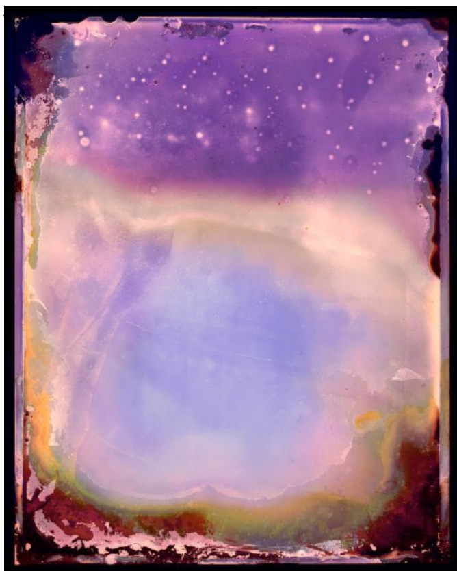
Fig. 3: Waxing Gibbous to Waxing Crescent, October 2020 II, 37°20'33.4"S 175°30'30.5"E. © Kate van Der Drift. 2021

for European timber, and the surrounding fields and human-built canals contain many times the maximum safe levels of excrement, hormones, and other by-products of New Zealand's dairy industry. In these acts of co-creation, a scanned 5x4 colour negative piece of film has been immersed in the silty depths of the river for a month, and on the emulsion surface, all the traces of human and other-than-human life can coalesce. These camera-less images are made, as van der Drift states, as "direct interaction between a photosensitive surface and the world" (Wilkinson 2024).