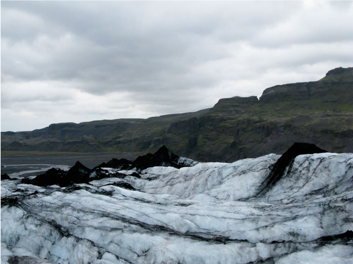
Glacier in Iceland, image by J. Hállstén, 2014

The research draws upon the Icelandic composer Jón Leifs (1899-1968), who endeavored to translate the Icelandic landscape into orchestral and choral works, such as in Hekla 6 (1961), a landscape that is sonically very complex. At the same time John Cage published Silence: Lectures and Writings (1961). Hekla is produced as the antithesis to Cage's piece 4'33" (1952). What is of interest here is how many of Jón Leifs' works are incredibly complex, making it either physically impossible to perform by singers or because they have so many instruments and other parts that they do not fit onto the average music stage.