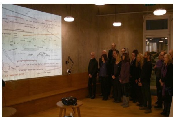
Rupture and Flow , J. Hällstén, performed by Juxtavoices, Nottingham Contemporary, 2019