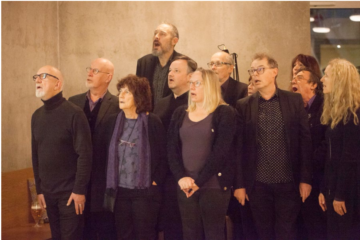
Juxtavoices performing Flow , J. Hällsten, 2019

The scores that both choirs translated on the day of the performance had not been rehearsed before. An important aspect of these kinds of scores is how they allow for each performance (whether with the same performers or not) to be different from one another. With many sound scores there are some instructions in terms of reading. For Rupture minimal information was given to Hljómeyki choir and none other than what it concerned for Juxtavoices. I chose not to include information for Juxtavoices for two reasons, to see what the difference would be between theirs and Hljómeyki's performance, in terms of sonic translation, and because Juxtavoices are experienced in working with sound scores, as they categorise themselves as an 'anti-choir'. 8