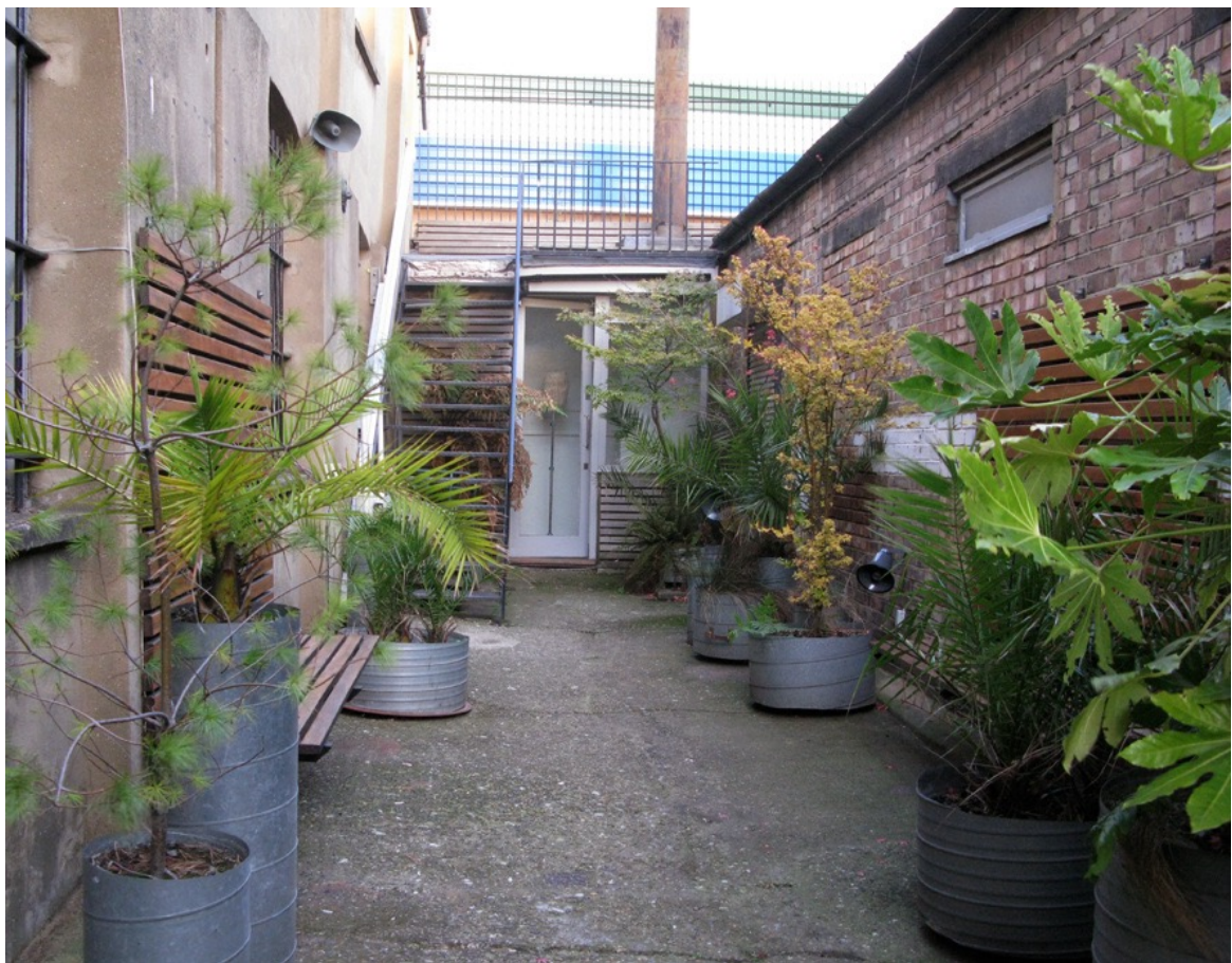
Onlookers Doubt , J. Hällstén, Cell Project Space, 2009

Time Breathe reprise (2010) 4 and others, through the use of a single voice or duet. The artwork has sought to test how we translate from one media to the other through the use of voice. Onlookers Doubt is a 5.1 surround sound call and response artwork, constructed of animal alarm calls and machine alarm calls (fire engine, fog horns etc). The artwork starts as the sounds being opposed to each other, however, as it progresses the calls enter into a dialogue and end becoming one. The work was first exhibited at Cell Project Space (London, UK) in the outside courtyard leading to the main gallery spaces. The visitors to the exhibition had to walk through this area to enter the gallery, and thus listen to the alarm calls and dialogue unravelling through this journey.