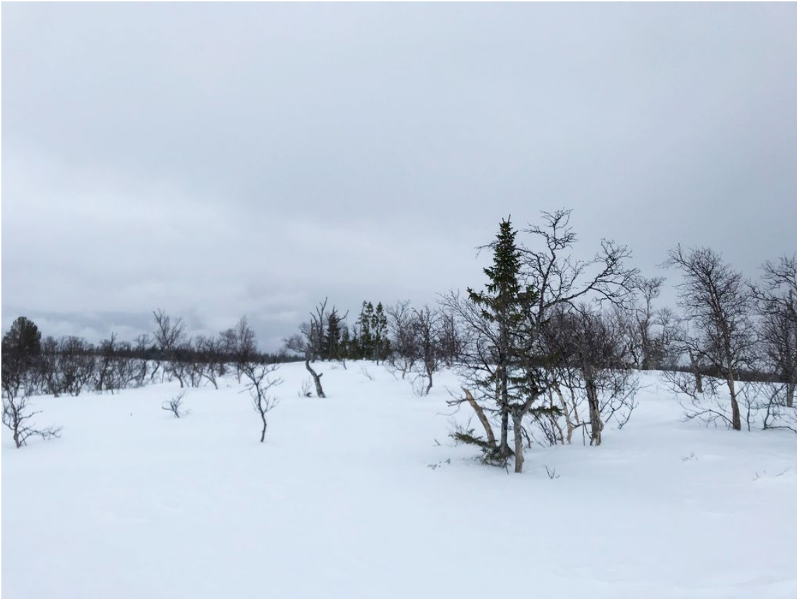
Snasahögarna, Sweden