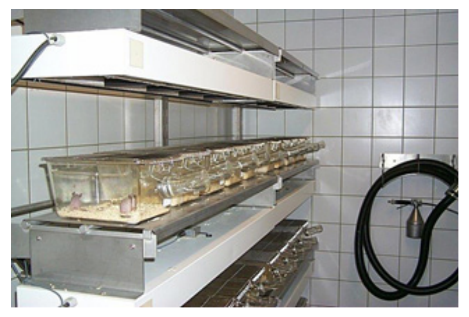
Figure 6: Mice being exposed to UVB

During the carcinogenicity experiments, mouse-human intra-action consisted mostly of handling the mice to clean the cages and exposing mice to test substances. XPA mice were exposed to either carcinogens or non-carcinogens during either six or nine months.<sup>9</sup> Exposure happened in several ways: UV-light exposure (figure 6), rubbing a substance on the skin, force feeding (gavage) or mixing a substance in the food.