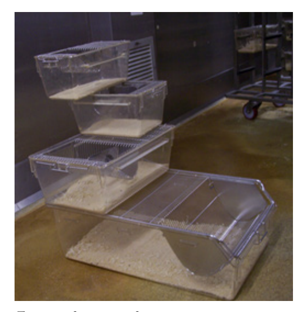
Figure 3: four types of cages

In a breeding efficiency study, it was found that mice PEI is higher in cage type 2, where the mice have more space than in type 1-elongated. But because type 1-elongated is narrower than type 2, it is possible to fit more type 1-elongated than type 2 cages into the same animal room. Therefore, XPA mice were living in type 1-elongated cages during the breeding process. The regular type-1 cage could not be used as animal welfare regulation had deemed it too small. Regulations also stipulated that the cages be 'enriched' with bedding and nesting material. According to A1, not all lines of