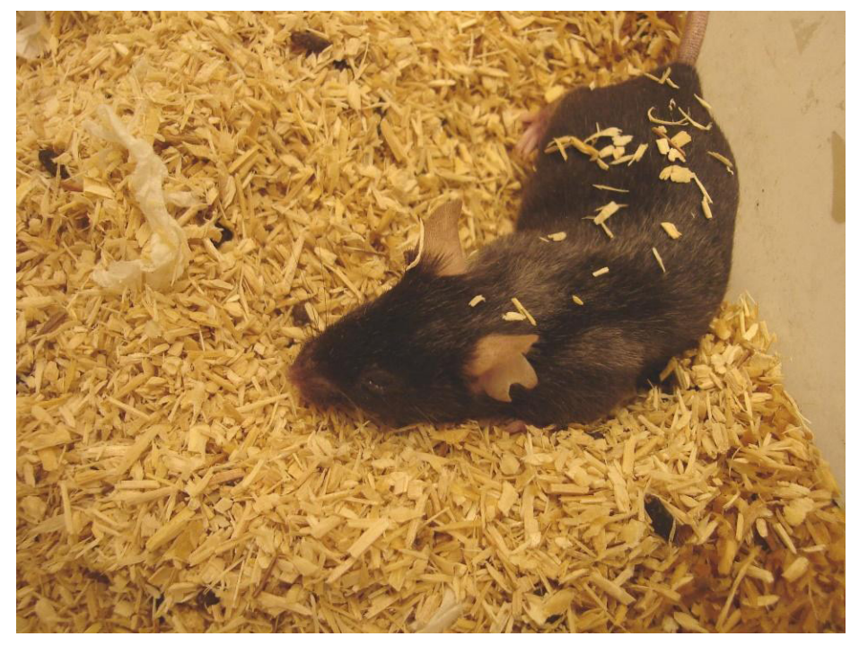
Figure 5: A mouse with ear cuts

Of all the XPA-mice born in the breeding facility, only the ones with genotype -/- were used in experiments. To find the mice with the desired genotype, they were genotyped. This was done by cutting of a piece of the tail, which was sent to the lab for