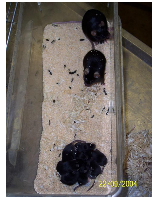
Figure 4: A mouse family in a cage

The 'breeding system' also focused on efficiency. A male and female mouse lived together 24/7 in the same cage; a system called permanent meeting breeding. When a female mouse gave birth, the baby mice stayed in the same cage for about 18 to 20 days. The picture above shows such a mouse family together in a type-1-elongated cage. The permanent meeting system had the 'advantage' of making use of the female mouse's postpartum estrus. After giving birth, she is fertile for 12-24 hours. If the male mouse is in the same cage the whole time, the female mouse can become pregnant again,