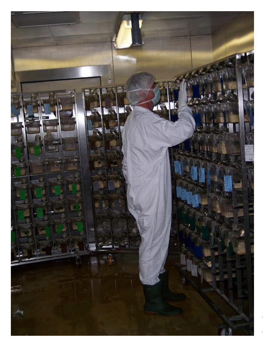
Figure 2: Animal Breeding Room

Humans held the XPA-mice in cages to prevent them from leaving. This may seem too obvious to even mention, but let us pause for a second and consider what a cage does. A cage first of all controls the space you can and cannot be in, who you can and cannot have contact with inside the cage. Beings you share the cage with or who have access to it cannot be avoided. The location and physical characteristics of the cage determine what you can observe and who you can contact outside of the cage and vice versa. A cage is also a constant reminder of the liveliness of these mice, dead mice or non-living materials do not need to be confined. The picture below shows a typical layout of one of the several animal rooms at the XPA-mouse breeding facility.