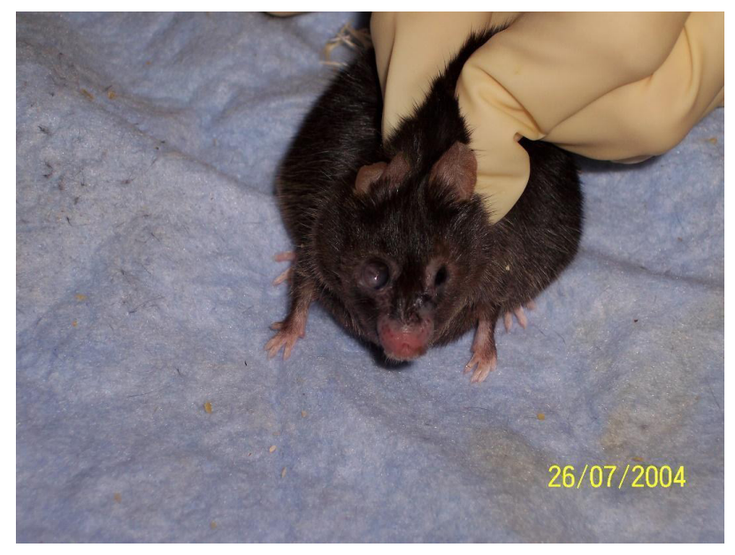
Figure 7: Mouse with eye pathology

The development of tumors was another type of suffering obvious to the respondents: "When a mouse gets a tumor that bothers him of course." (S2). Here certain behavior of the mouse was also seen as a sign of suffering: "And sometimes it was really sad, then they would have a big tumor and crawl away into a corner, that is what you see." (L1). When it came to tumors, measures were taken to make sure the mice did not suffer more than was necessary for the experiment.